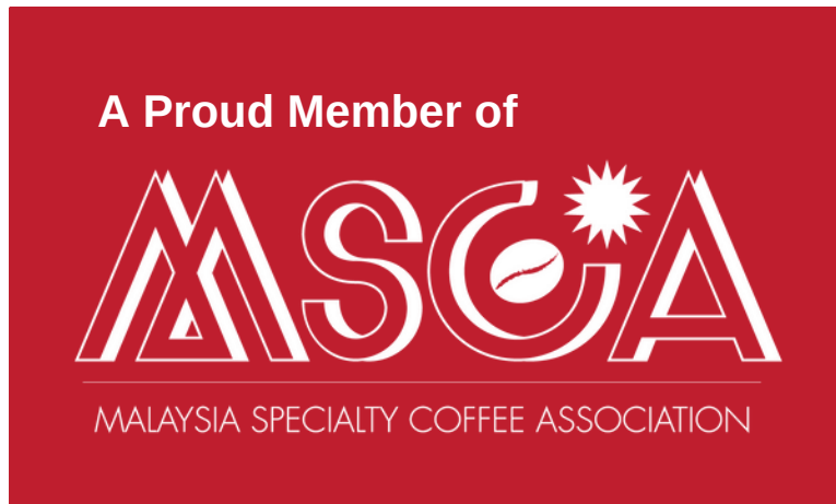
Mono Colour Background